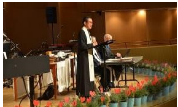
The Moderator and Clerks of General Assembly