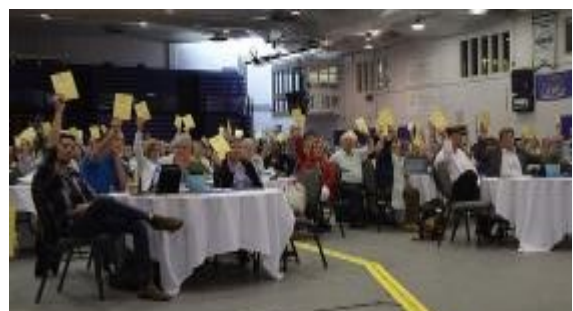
The Commissioners Vote