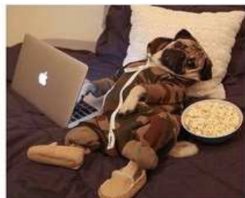
"I think I'll just work from home today."