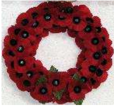
This Photo by

Sunday services are also available online at 10 am on Zoom