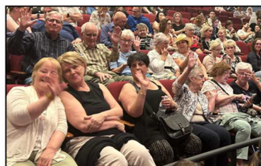
"A Gentleman's Guide to Love & Murder" Orange Hub Theatre - June '25

Recollections + Reflections will be formally launched at the 2025 General Assembly, taking place this year at McMaster University. Copies can also be ordered.